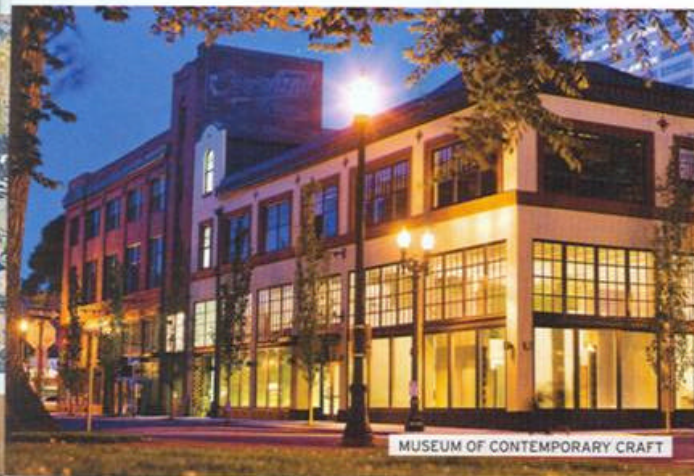
MUSEUM OF CONTEMPORARY CRAFT