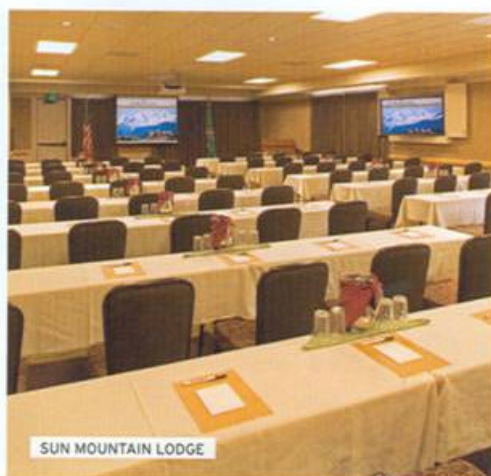
SUN MOUNTAIN LODGE